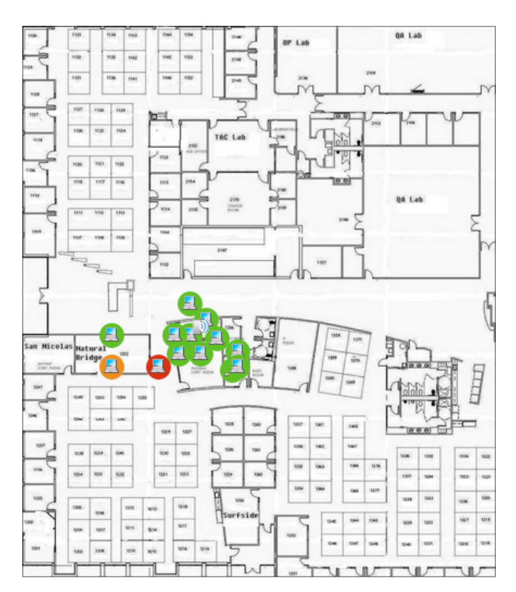
Figure 2: This floor plan shows an unhealthy client (red), which ClientMatch will automatically steer to a better AP and radio to optimize overall performance.

When a client attempts to connect to an AP that provides sub-optimal performance, ClientMatch uses client steering to direct that client to a better AP. For example, if a client connects to an AP with a weak signal, ClientMatch will steer that client to an AP with a stronger signal.